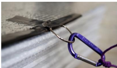
Connect rope to "D" rings