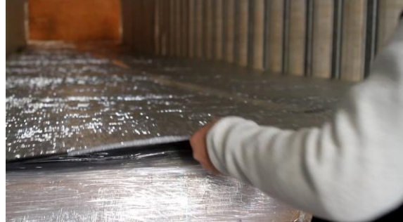
Use ropes to pull the Astro-Quilt all the way out to the final pallets

Now simply fold the remaining portion of the Astro-Quilt down to the floor sealing the last two pallets of the container and tuck in neatly to avoid air gaps.