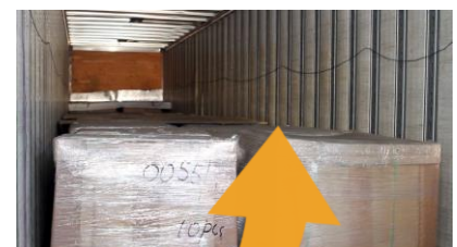
Ropes attached to wall while loading